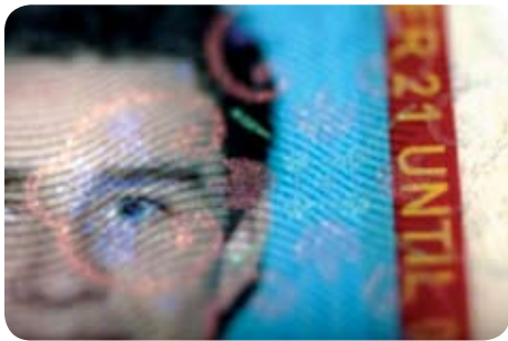
Digimarc solutions are designed to crosscheck and verify data supplied by the applicant.

date of birth and zip code. Data returned for each query includes Yes/No answers to a number of specific questions. These answers are derived from comparing the information submitted by the applicant against a multitude of different public record sources harvested by the online data service. The Digimarc system analyzes the returned information to determine whether a specific applicant should be flagged for further investigation.